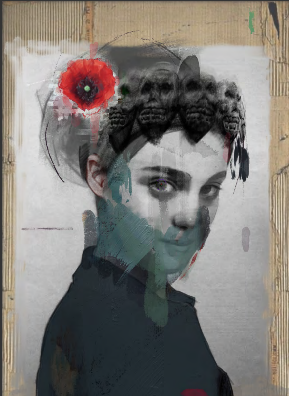
Garlands No. 4 48 x 34cm Mixed Media 2021