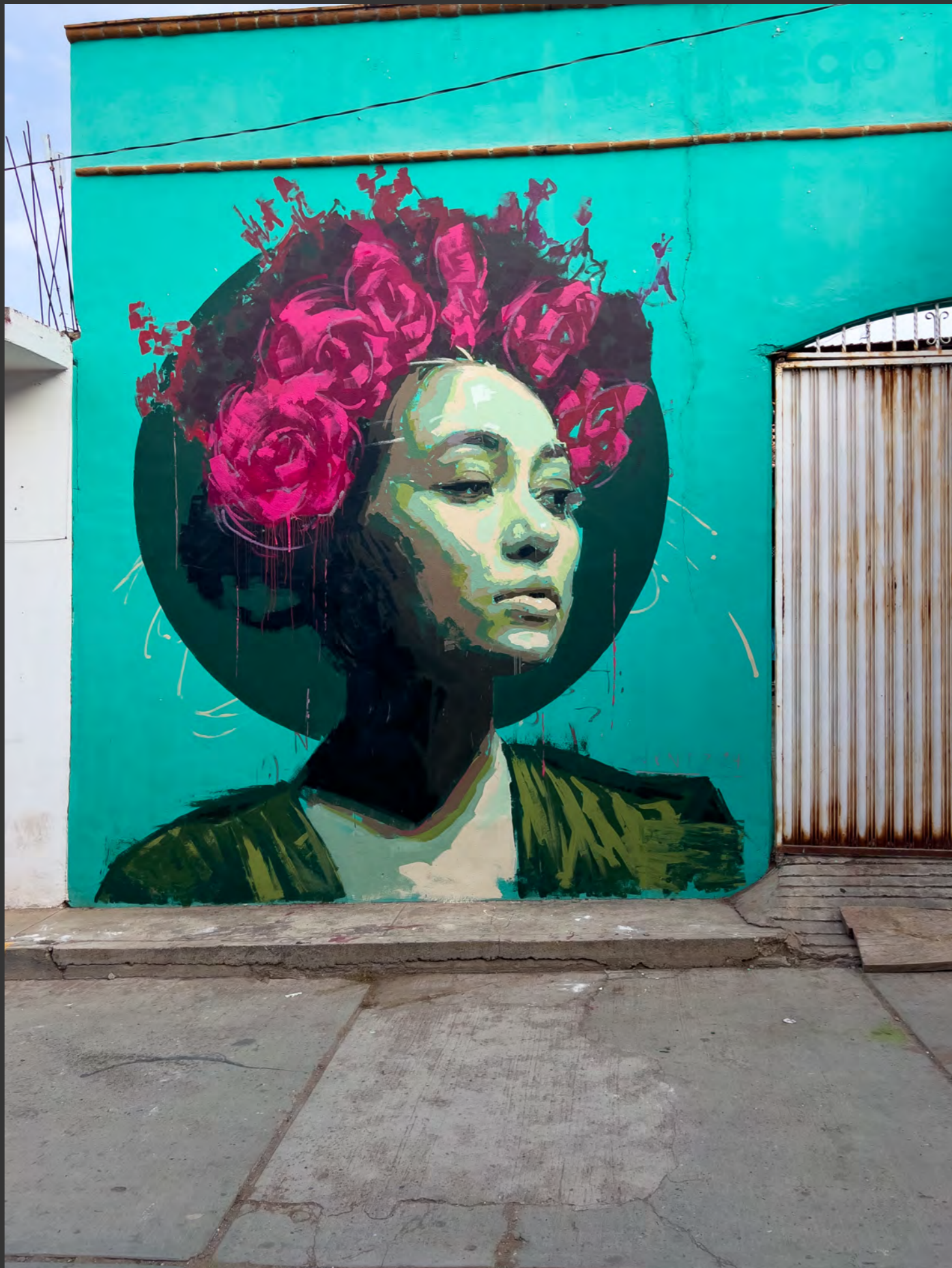
Street Art Festival Cuicatlan Cuicatlan, Oaxaca, Mexico 2024